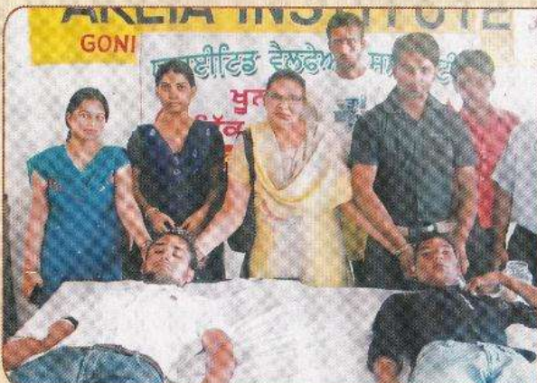
Our Students donating blood during blood donation camp at Aklia Institute 48 students donated blood in this camp.