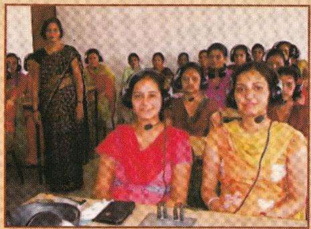
A View of Communication Skill Lab