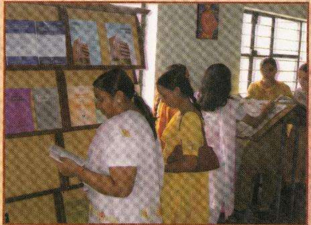
A View of Library