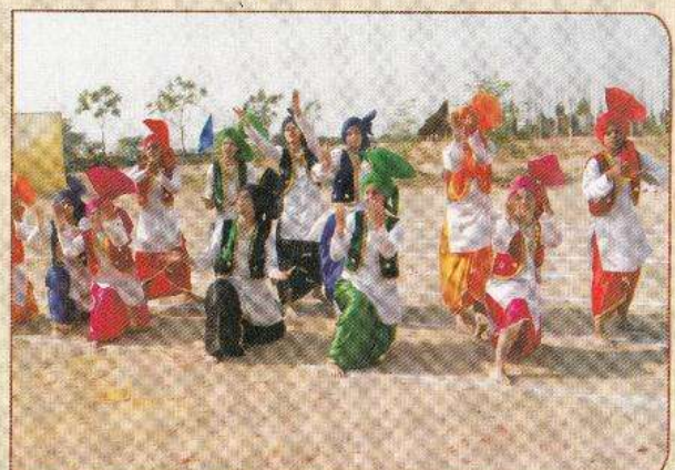
Our Students presenting Cultural Activities Programme