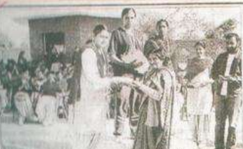
ਆਕਲੀਆ ਕਾਲਜ ਆਫ਼ ਐਜੂਕੇਸ਼ਨ ਫਾਰ ਯੂਮੈਨ ਵਿਖੇ ਦੋ ਰੰਗਾਂ ਸ਼ਾਲਾਨਾ ਐਥਲੈਟਿਕ ਮੀਟ ਸਮੇਂ ਇਨਾਮ ਵੰਡਦੇ ਹੋਏ ਮੁੱਖ ਮਹਿਮਾਨ।