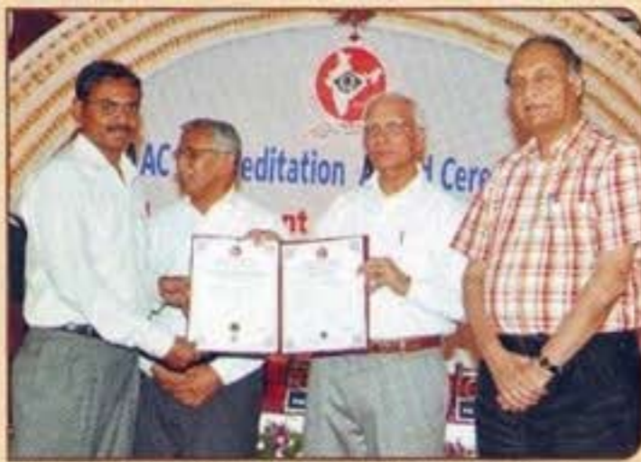
Our Vice Principal getting Certificate of "B Grade" from Chairman NAAC at the ceremonial function at NAAC headquarter Bangalore