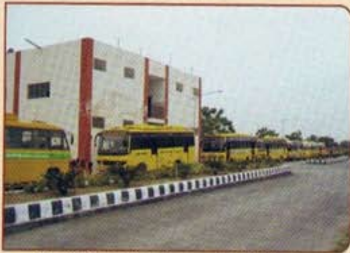
The College has its own fleet of buses which provide facility of 'pick and drop' from every corner of city & nearby rural areas.