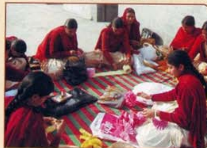
Pupil-teachers Preparing Teaching aids