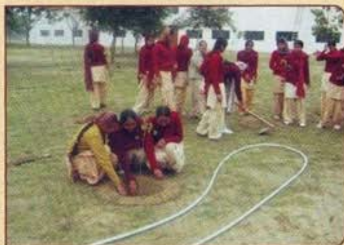
NSS volunteers busy in plantations at the eve of VANMAHAUTSAV