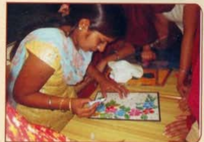
Our Students Participated in Painting Competition