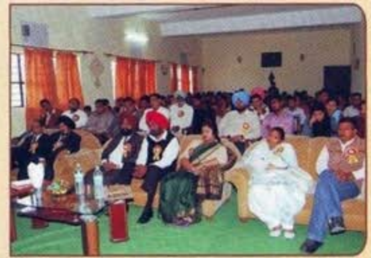
Delegates & Participants of the Seminar