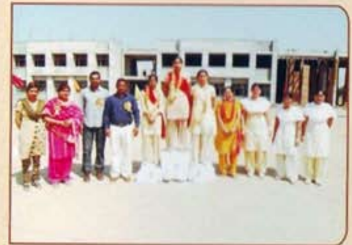
Prize distribution during Athletic Meet