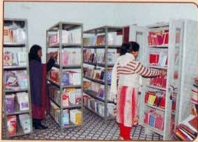
A Glimpse of College Library