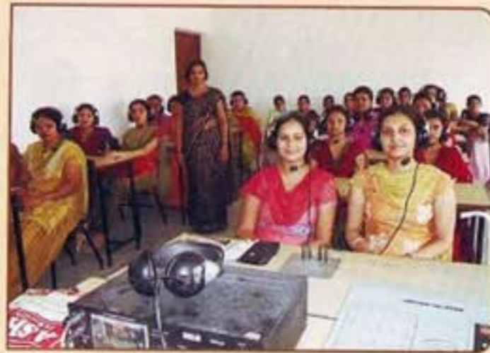
Students in Language & Communication Laboratory