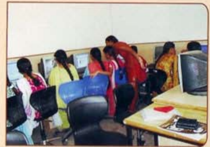
Centrally AC Computer Laboratory