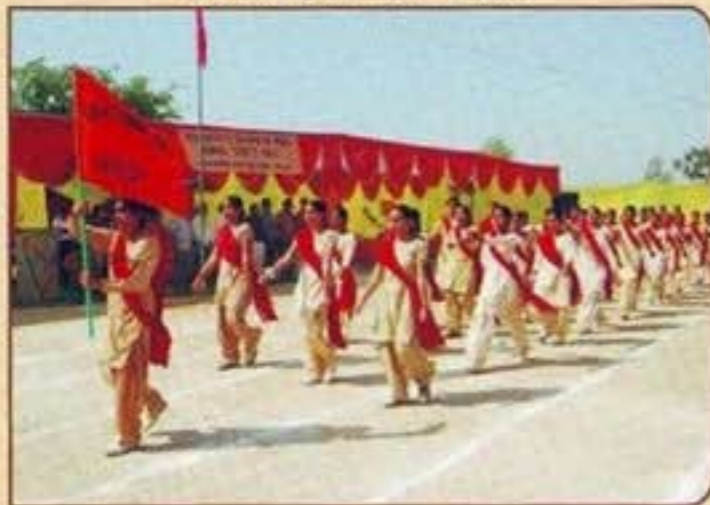
Even then our girl students are marching ahead in Indian Society with Danda in Jhanda