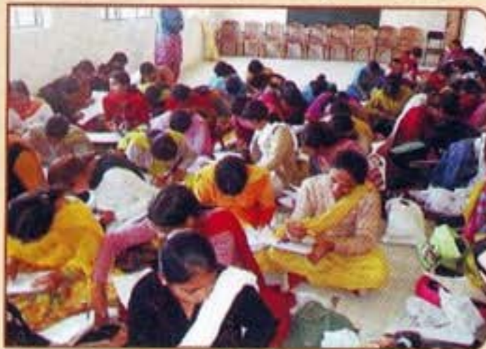
A View of Art & Craft Room